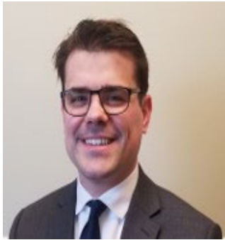
Natch Greyes Government Affairs Counsel